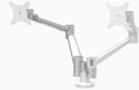
Expandable to dual screen version