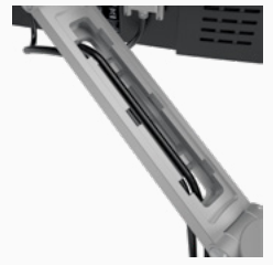
Integrated cable management