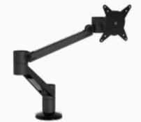
Also available in black